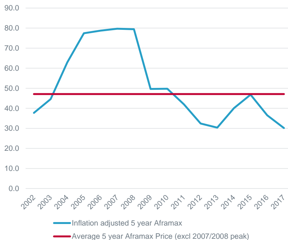
Asset Values Currently Near Historic Lows