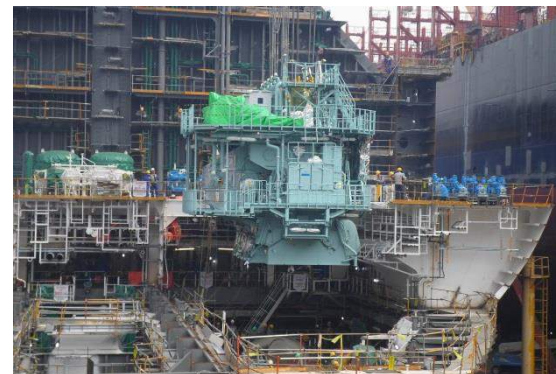
Creole Spirit – first ever MEGI LNG carrier