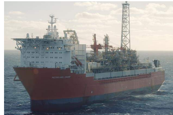
Knarr FPSO on its field in the North Sea